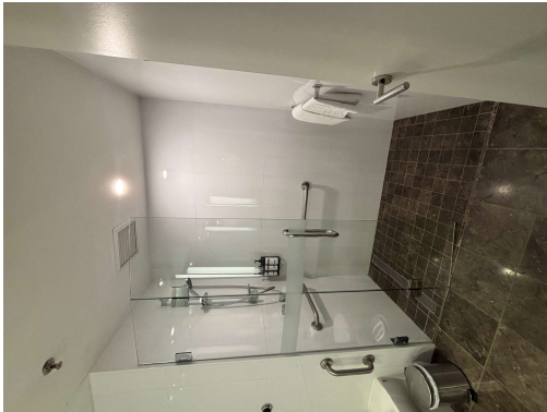
full bathroom layout