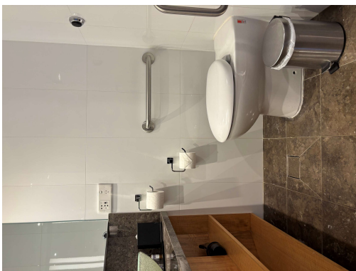
toilet showing space beside and handrail location