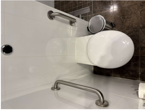
toilet showing space beside